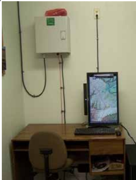
Control system and monitor in MVIC office

Flow meters and valves at key locations are equipped with electronic controllers and transmitter / receivers and can wirelessly communicate their status using radio telemetry to a receiver and master control center at the MVIC office. The two-way wireless communication system is expandable and provides a framework for automation of other parts of the MVIC system.