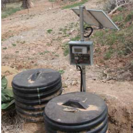
Solar-powered, digital flow monitor with wireless communication, and covered manholes housing ultrasonic flow meter unit and remote-controlled valve

CORTEZ, Colo. – Below the rugged pinon and juniper-clad hills surrounding Cortez, Colorado, a new five (5) mile pipeline and automated water control and distribution system has virtually eliminated water losses and improved delivery efficiency.