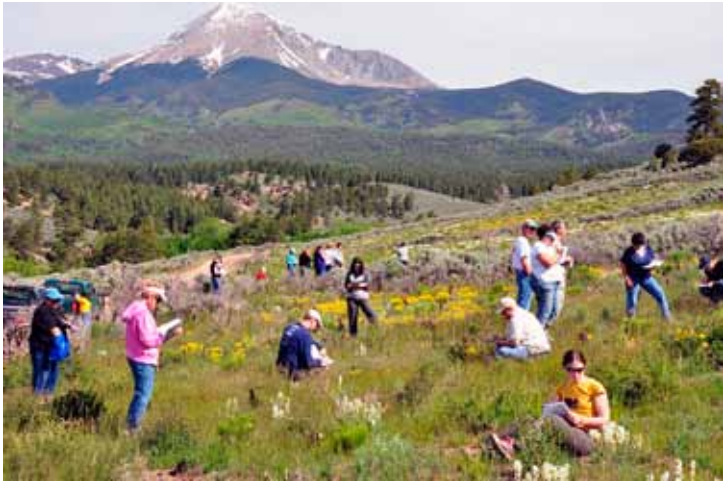
(Left) Teachers learning about ecosystems.