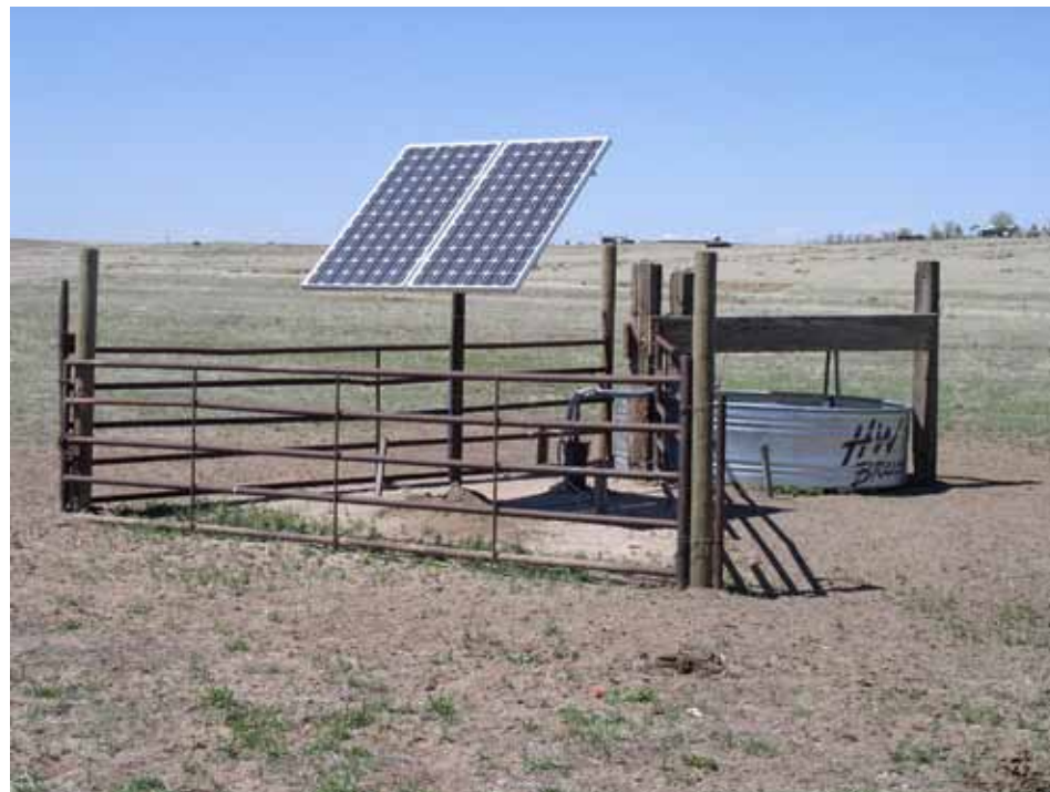
Water facilities are critical to enable good grazing management. The High Plains and Prairie conservation districts used Matching Grant funds to cost-share solar powered water pumps to provide water tanks in remote areas.

Under ever-changing natural resource uses and values, conservation is necessarily a dynamic, adaptable activity. For example,