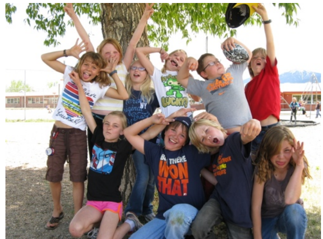
The distinguished staff of the Lions Way Offline edition.