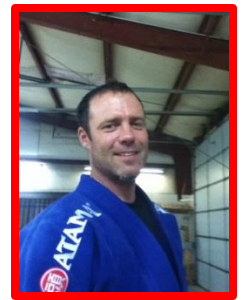
That's my Sensei.