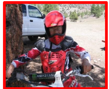
This is me!

You don't have to go fast or race; you can ride dirt bikes just for fun!