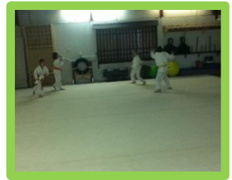
We play fun games, too!